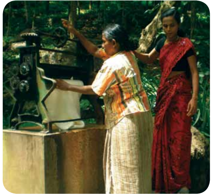
Machine converting latex into rubber sheets