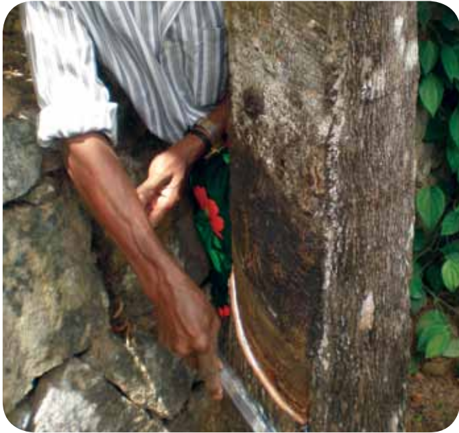
Extracting latex from a rubber tree