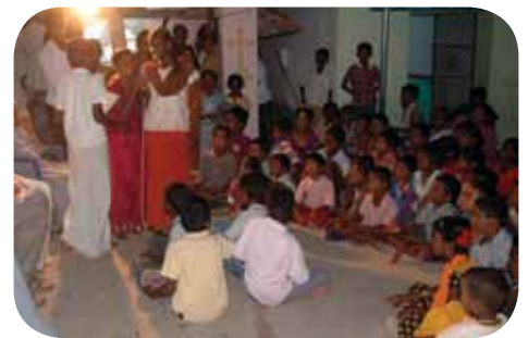
Kaani ladies participating in a Community welcoming ceremony, Children role playing Pudukottai